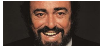
Pavarotti: Genius Is Forever: Entertaining, even for experts

posted on May 31, 2019 | under Classical, Vocal